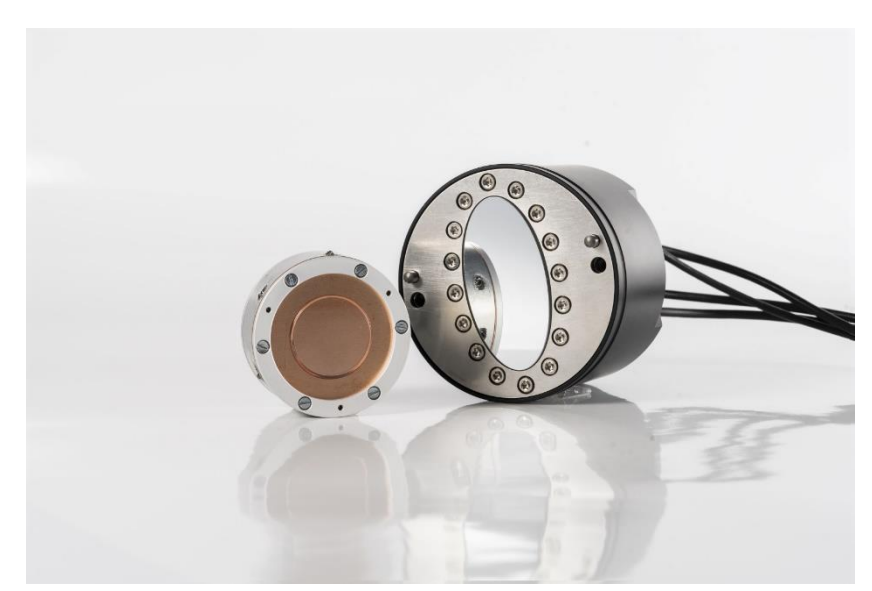
Figure 3: Adaptive focusing mirrors with ultra-short reaction times. Left: Version with integrated plane field correction for applications in laser structuring systems. Right: Version for laser cutting/laser welding.

PRESS RELEASE June 17th, 2019 || Page 4 | 4