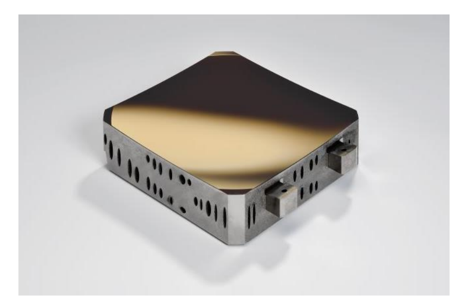
Figure 1: Additively manufactured lightweight mirror made of AlSi alloy after final polishing step.